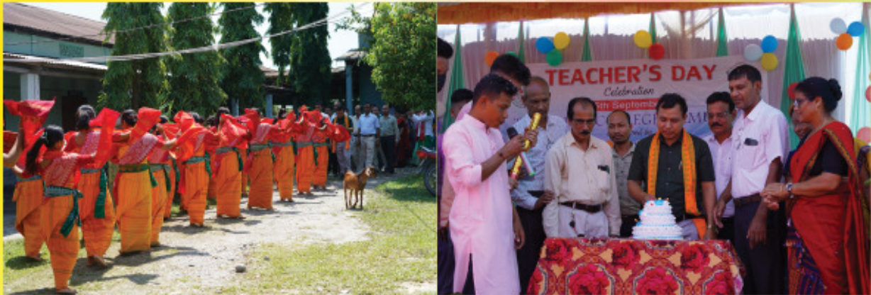
A Glimpse of Teachers' Day Celebration at Tamulpur College on 5 th September, 2023