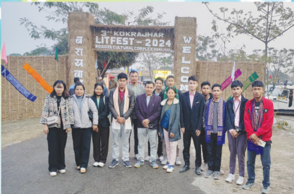
A Glimpse of Students & Teachers participating in literary festival organised by Bodoland University from 27 th January to 29 th January, 2024