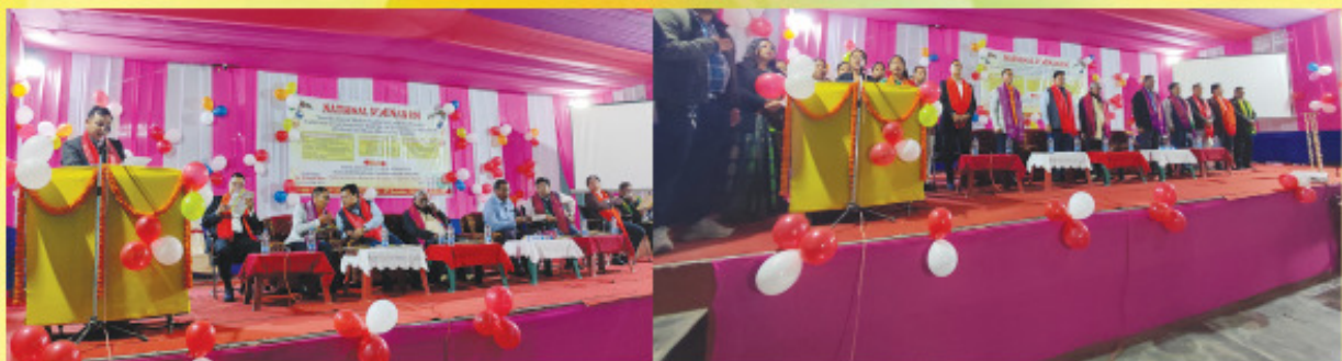
A Glimpse of Opening Ceremony of National Seminar organised by Tamulpur College in collaboration with Bodoland Senior Citizen Forum on 10th December, 2023