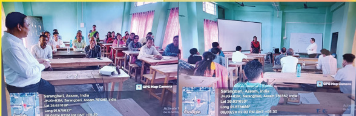
A Glimpse of Teachers from Tamulpur College, Dimakuchi College & Tamulpur Degree College participating in one week Faculty Development Programme on Presentation and Communication Skills from 4 th March to 9 th March, 2024 Organised by IQAC Tamulpur College in collaboration with ICT Academy (an initiative of Govt. of India) at Tamulpur College.