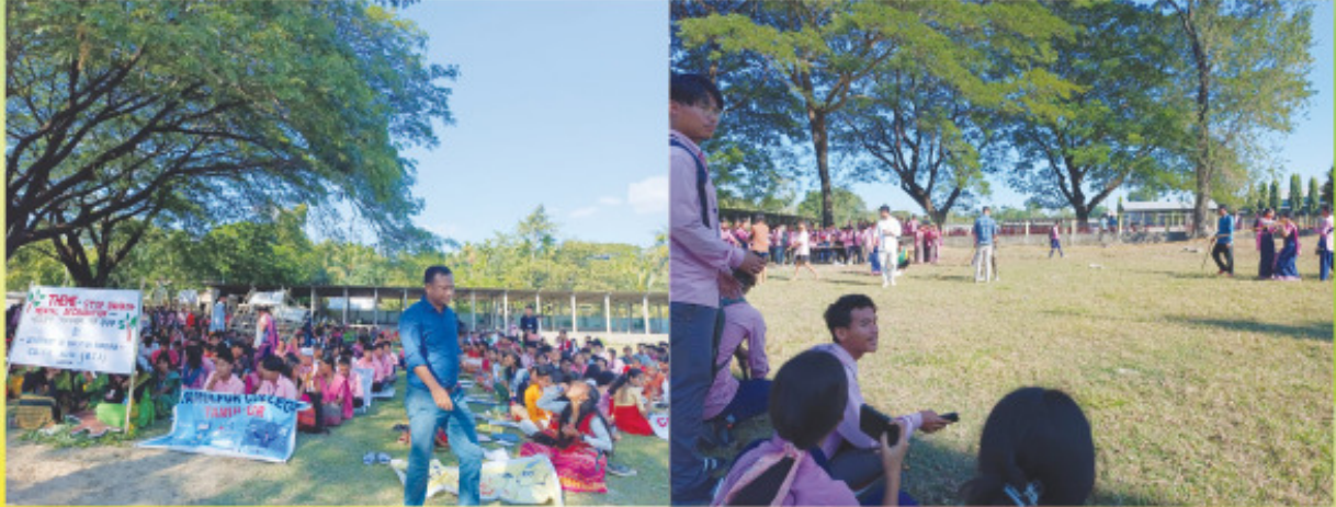
A Glimpse of students participating in 38 th College Week Organised by Tamulpur College Students Union 2023-24 at Tamulpur College Premises